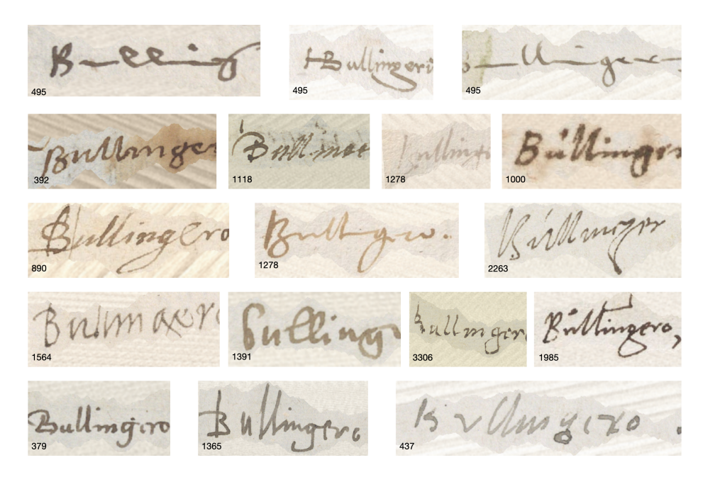
Fig. 2. Different writing styles and different forms of the word "Bullinger". The writer IDs are indicated in the bottom-left corner of each automatically segmented word. All words of the first line are written by the same writer, Bullinger himself.

Note that the sample word images were automatically cut out from text lines that have been processed by an HTR system and may contain segmentation errors. The text lines themselves were cut out from the scanned page images according to polygonal boundaries provided by Transkribus' layout analysis system. The special background pattern around the text lines is added artificially instead of white background, to make the background more homogeneous for HTR.